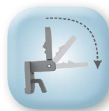
Turn down clamp for easy loading/unloading