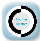
Counter balance for stable operation