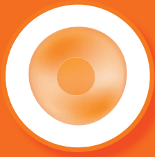
ANTI MÜLLERIAN HORMONE (AMH)