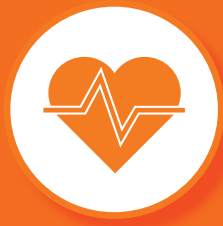
BRAIN NATRIURETIC PEPTIDE (BNP)