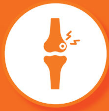
BONE MARKERS (SERUM)